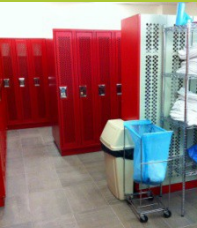
Towels & Lockers