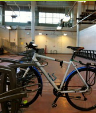
Yoga for Cyclists